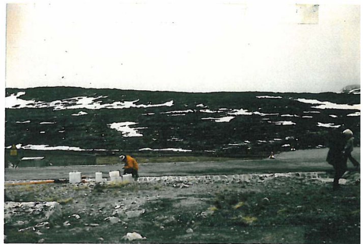
Station seen from NW